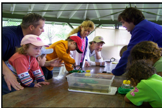
Mother Earth Day participants studying aquatic invertebrates.