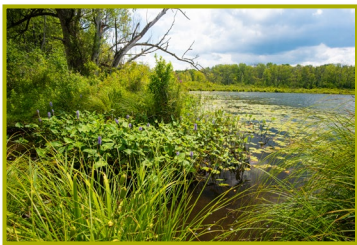
Cassadaga Lakes Nature Park.